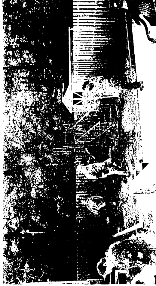
Several of the more than 30 Home Depot employees who volunteered to give Dottie's House a makeover.

This fund activity, along with other fund raising events, helps to keep the doors of Dottie's House open -- and will also be of great assistance as we look to expand this much needed facility.