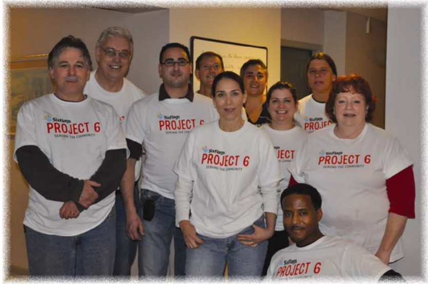
Staff from Six Flags Great Adventure lend a helping hand to Dottie's House during their Project 6 Day of Service.