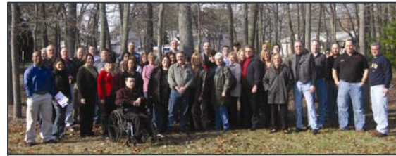
Lennar Staff gather at Dottie's House for their Focused Act of Giving.