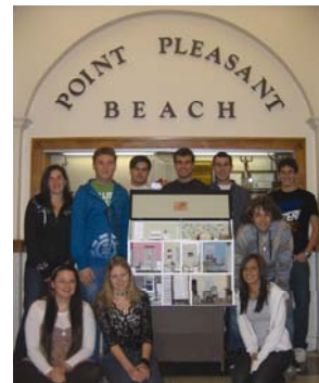
Point Pleasant Beach High School Students present their Community Service Project to Dottie's House.